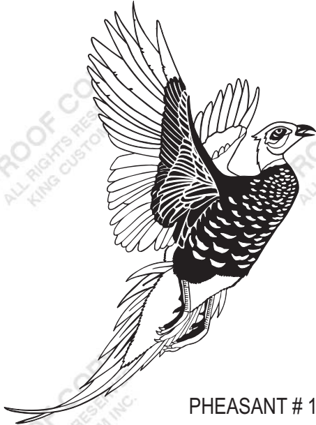
PHEASANT # 1