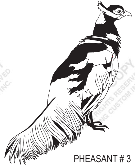
PHEASANT # 3