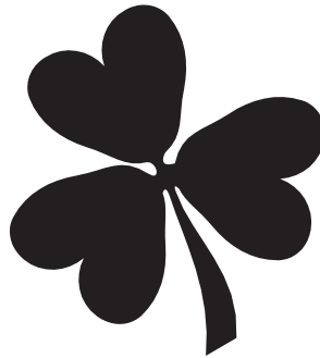
SHAMROCK # 2