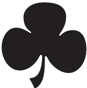
SHAMROCK # 7