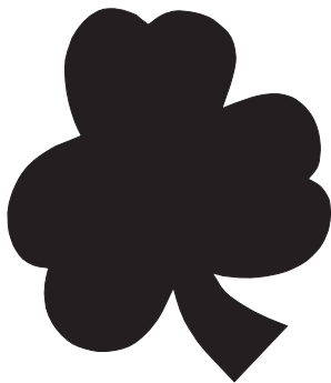
SHAMROCK # 4