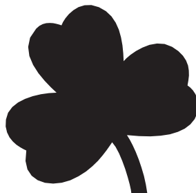
SHAMROCK # 5