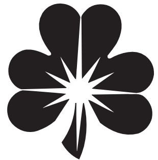
SHAMROCK # 6