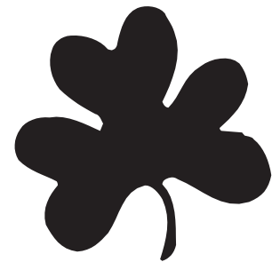
SHAMROCK # 3