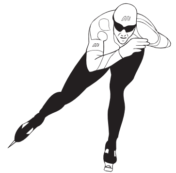
ICE SKATE 12