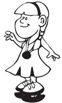
ICE SKATE 8