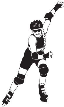
ICE SKATE 9