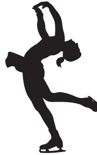
ICE SKATE 3