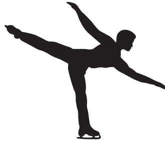
ICE SKATE 2