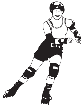
ICE SKATE 10