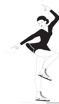
ICE SKATE 7