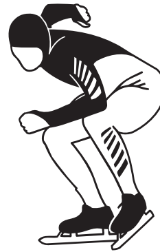
ICE SKATE 11