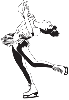
ICE SKATE 1