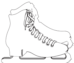
ICE SKATE 13