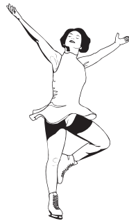
ICE SKATE 6