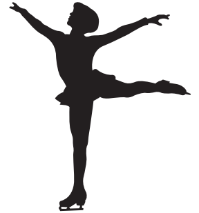
ICE SKATE 4